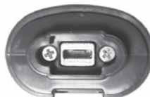
Bottom view: micro USB connector with rubber cap open.

Plug the USB cable into the AC power adapter, computer USB connector or external USB battery pack, and then plug the micro USB connector into the EXO GO to charge the battery.